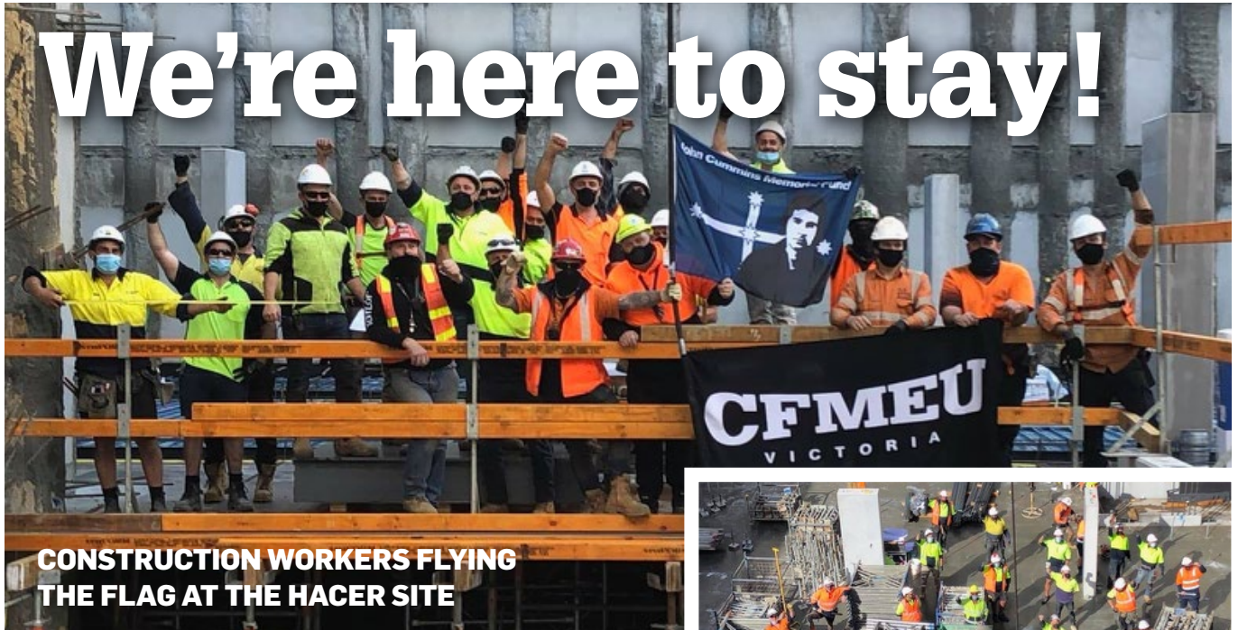
CONSTRUCTION WORKERS FLYING THE FLAG AT THE HACER SITE